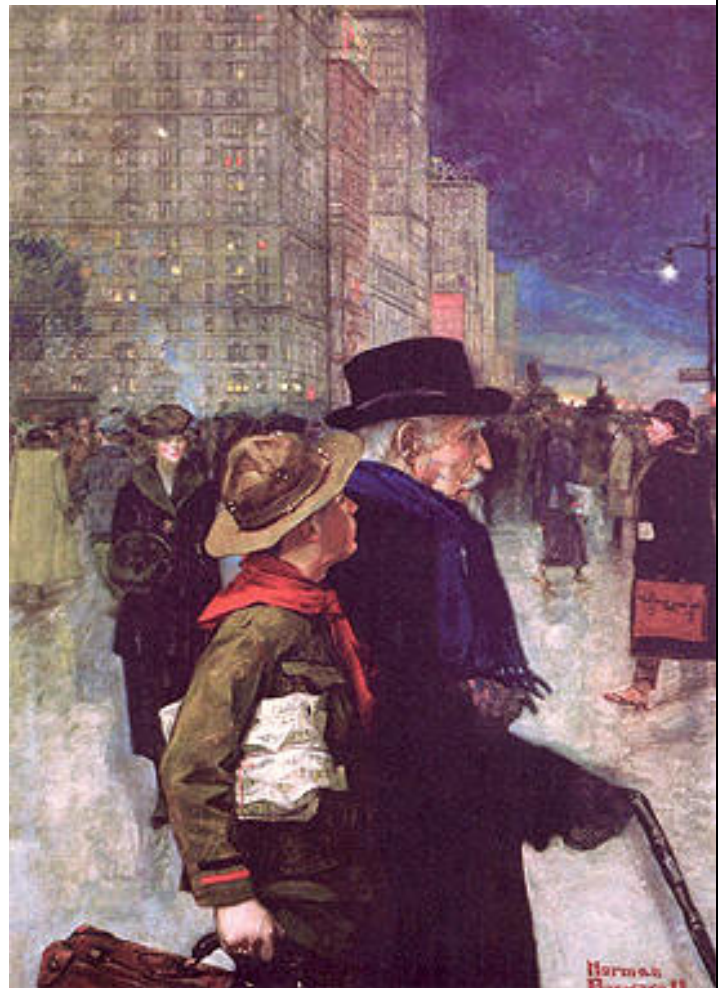
"The Daily Good Turn" by Norman Rockwell

In the British Scout Training Center at Gilwell Park, England, Scouts from the United States erected a statue of an American Buffalo in honor of this unknown scout. One Good Turn to one man became a Good Turn to millions of American Boys. Such is the power of a Good Turn