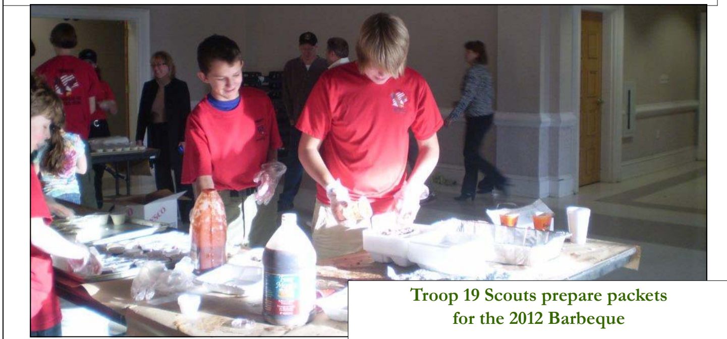
Troop 19 Scouts prepare packets for the 2012 Barbeque